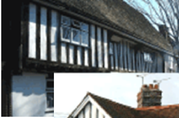
Exposed Beams & Gable end detailing