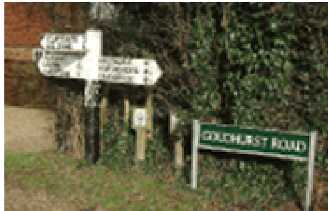
Old & New signs