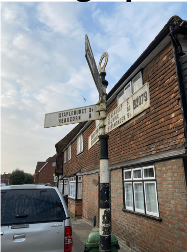
Old fingerpost sign