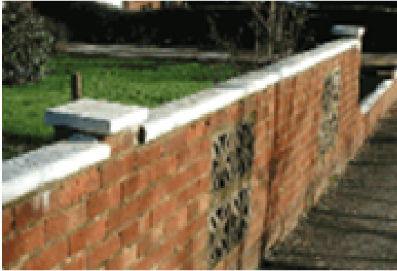
Brick Wall Decoration & Metal Railings