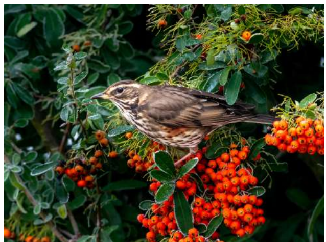
Redwing (red listed bird) – Sue Pennicott

Marden Wildlife rounded-off its first year with new followers, new species discovered in the village (some, nationally rare insects and plants, others spectacular arrivals like the Great White Egret) and an outstanding new book celebrating the village's natural treasures. Members enjoy finding and recording anything and everything - from bats to butterflies and orchids to Odonata. Tracking turtle doves for the RSPB and helping local farmers increase yellowhammer numbers, have all helped maintain Marden's rural surroundings. We now boast more moth traps per household than anywhere in Kent! Villagers have taken to identifying these magical insects in their gardens, assisted online by our own experts.