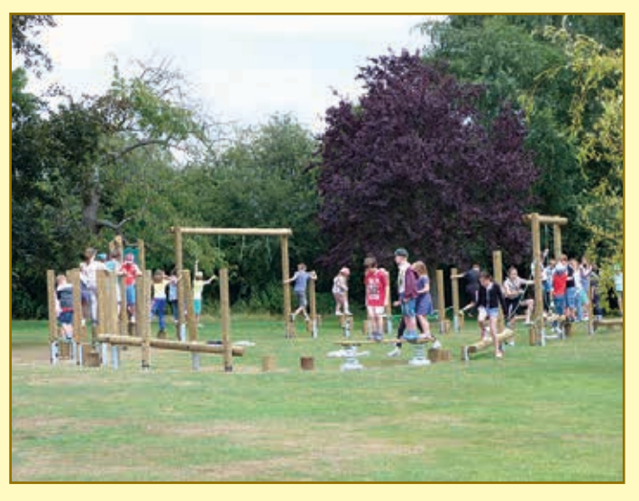
○ Southons Field – it is pleasing to see residents and their children using the new Play Trail area (above) and the Parish

○ Napoleon Drive Play Area — the Parish Council are still in the process of transferring this play area from Taylor Wimpey, but hopefully in 2016/17 we will be able to replace the current play equipment for the under 5's dependent on Developer Contribution monies. Councillors did discuss removing some of the hedgerow between the Playing Field and the Napoleon Drive play area, but to put residents' minds at rest, it has now been decided that it will just be given a general 'haircut' instead.